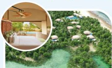
📍 UGA Chena Huts