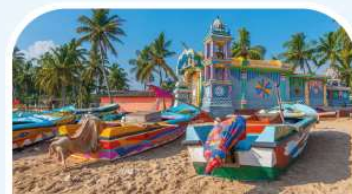
📍 Bala Murugan Temple, Trincomalee

Tailor-make your Sri Lanka Adventure with premier holidays