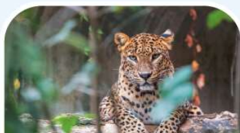
📍 Yala National Park