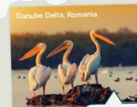
Danube Delta, Romania

"I had such a great time and can't stop telling everyone how good it was!"