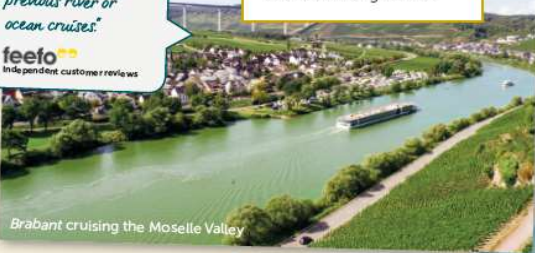
Brabant cruising the Moselle Valley