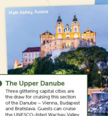
Melk Abbey, Austria

Three glittering capital cities are the draw for cruising this section of the Danube - Vienna, Budapest and Bratislava. Guests can cruise the UNESCO-listed Wachau Valley and visit the German cities of Passau and Regensburg - both offering historic charm in spades.