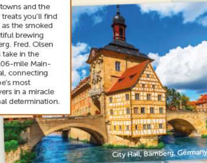
City Hall, Bamberg, Germany

The Main is characterised by its quaint towns and the gastronomic treats you'll find ashore, such as the smoked beer of beautiful brewing town, Bamberg. Fred. Olsen River Cruises take in the astounding 106-mile Main-Danube canal, connecting two of Europe's most significant rivers in a miracle of navigational determination.