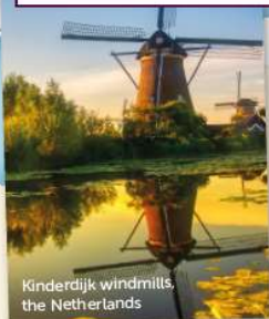
Kinderdijk windmills, the Netherlands

Guests can meander market squares and seek out springtime tulips in Keukenhof Gardens before gliding through the beautiful IJssel and Lek Rivers. They'll also enjoy stops at the UNESCO-listed Kinderdijk windmills, an extended stay in Amsterdam and a delightful diversion to Antwerp.