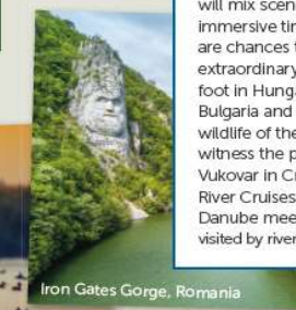
Iron Gates Gorge, Romania

A journey along the Lower Danube will mix scenic cruising with immersive time ashore. There are chances to sail through the extraordinary Iron Gates Gorge, step foot in Hungary, Croatia, Serbia, Bulgaria and Romania, see the wildlife of the Danube Delta and witness the post-war rebuilding of Vukovar in Croatia. Plus, Fred. Olsen River Cruises take you to where the Danube meets the Black Sea, rarely visited by river ships.