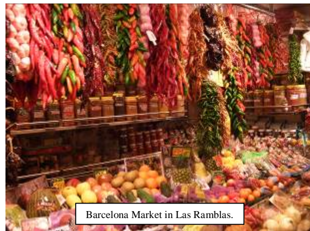
Barcelona Market in Las Ramblas.

The morning was spent on an excursion, taking in the main sights including the Olympic stadium, Segrada Fanilia, the Columbus monument and Casa Batillo (one of the works of Gaudi.) I then spent the afternoon wandering around Las Ramblas window shopping and enjoying the vibrant colours and sounds of the large indoor market.